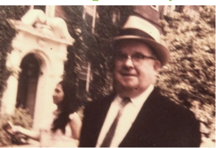
See page 3.