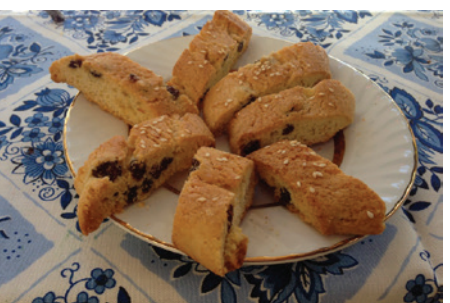
See page 2.